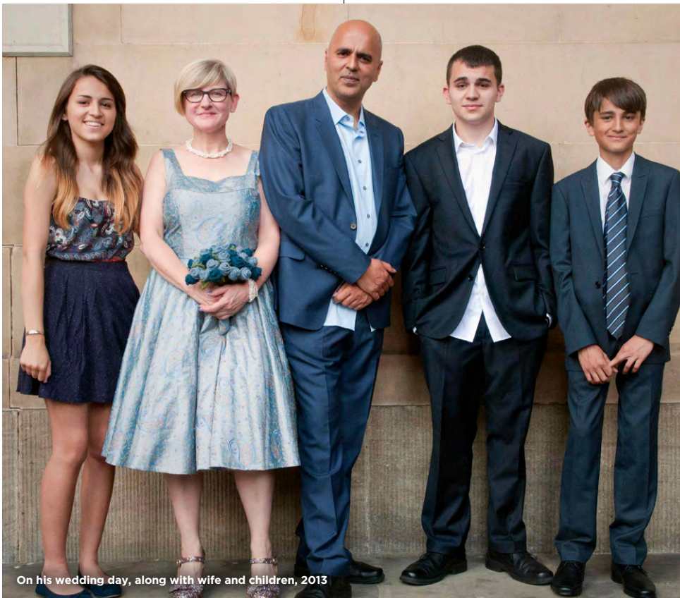
On his wedding day, along with wife and children, 2013

It's not a big, brash story, but it does go to show that staying lean, flexible and honest can really pay off.