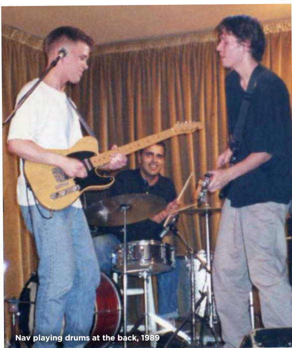
Nav playing drums at the back, 1989

Ten years on and a decade of government austerity, economic uncertainty following Brexit and a global pandemic may just show