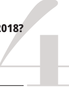
Table I.4.3 [1/2] Comparing countries' and economies' performance in science