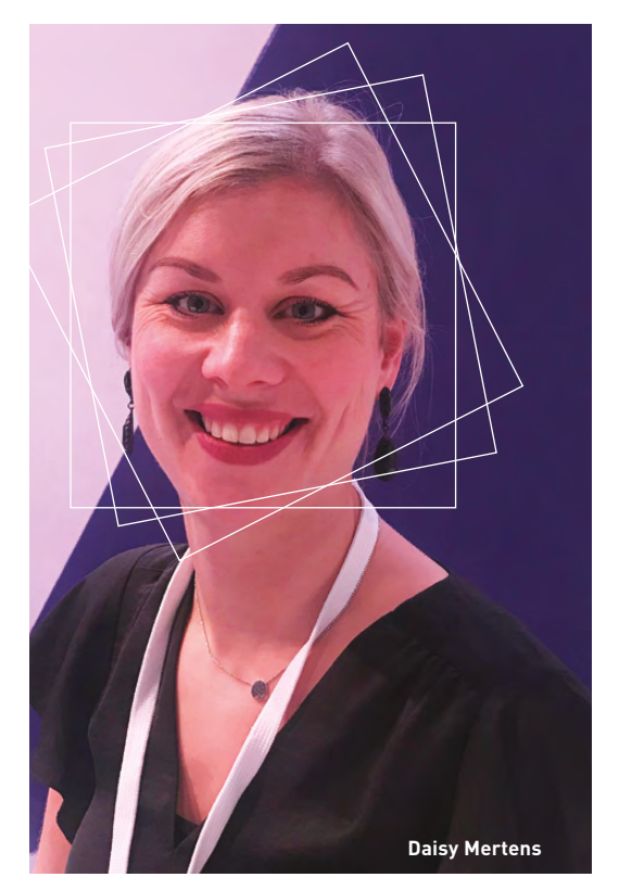
is the most effective and powerful way to have the dialogue sessions, to achieve together and create innovation and change."

"We are now building on it to really know what