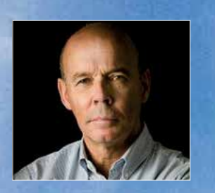
SIR CLIVE WOODWARD