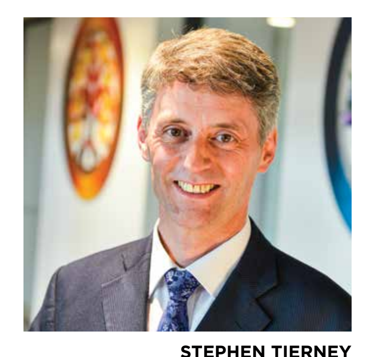
CHAIR OF HEADTEACHERS' ROUNDTABLE

Keep education the key issue in this Election; our nation's children deserve it!